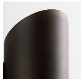
-22 Oiled Bronze