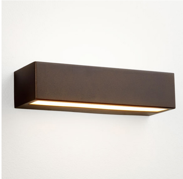
-22 Oiled Bronze