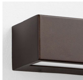
-22 Oiled Bronze