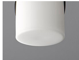
-1 White Opal Glass