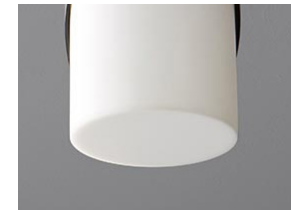
-2 Matte White Acrylic