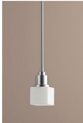
-14 Polished Chrome