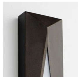
-22 Oiled Bronze

LIGHT SOURCE 1 x 12.1W LED, 3000K, CRI 90 LUMINAIRE POWER 14.4W at 120V RATED LIFE 60000 hr RL OPTIONAL COLOR TEMPERATURES 2700K, 3500K, 4000K LUMEN OUTPUT Delivered: 426 lm (LM-79) INPUT VOLTAGE 120V to 277V AC, 50/60Hz DRIVER OUTPUT 350mA, 14.7W max power DIMMING TRIAC and ELV dimming at 120V AC; 0-10V dimming, 100% to 1% current output CONSTRUCTION Cast Aluminum and Polycarbonate DIFFUSER - White Polycarbonate FINISHES Gray (-16), Oiled Bronze (-22) MOUNTING 4" Octagonal J-Box*, 4" Square J-Box* with a single device mud ring** * Deep J-Box (Required to house driver) ** Mud ring must be mounted horizontally (Installer must provide a bead of caulk between fixture housing and mounting surface) STANDARDS UL Wet listed, ADA Compliant, Conforms to UL STD 1598, Certified CAN/CSA STD C22.2 No 250.0.