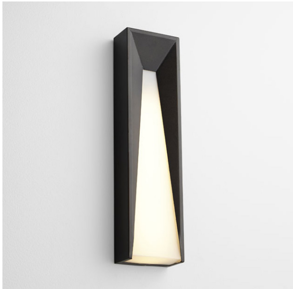
-22 Oiled Bronze