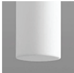
-1 White Opal Glass -2 Matte White Acrylic

LIGHT SOURCE 1 x 5.2W LED, 3000K, CRI 90 LUMINAIRE POWER 6.59W at 120V RATED LIFE 60000 hr RL OPTIONAL COLOR TEMPERATURES 2700K, 3500K, 4000K LUMEN OUTPUT Delivered: (-1) Glass: 244 lm (LM-79) Delivered: (-2) Acrylic: 213 lm (LM-79) INPUT VOLTAGE 120V or 277V DRIVER OUTPUT 150mA, 6W max DIMMING 0-10V & Phase (ELV) Dimming - 50/60Hz 100% to 10% Dimming CONSTRUCTION Plated Steel and Acrylic / Glass METAL FINISH / DIFFUSER (-115) White Opal Glass / Black (-120) White Opal Glass / Polished Nickel (-124) White Opal Glass / Satin Nickel (-215) Matte White Acrylic / Black (-220) Matte White Acrylic / Polished Nickel (-224) Matte White Acrylic / Satin Nickel MOUNTING 4" Octagonal J-Box* 4"x4" Square J-Box* with single device mud ring *Deep J-Box (Required to house driver) STANDARDS ETL Dry/Damp listed, Conforms to UL STD 1598, Certified CAN/CSA STD C22.2 No 250.0.