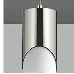
-20 Polished Nickel