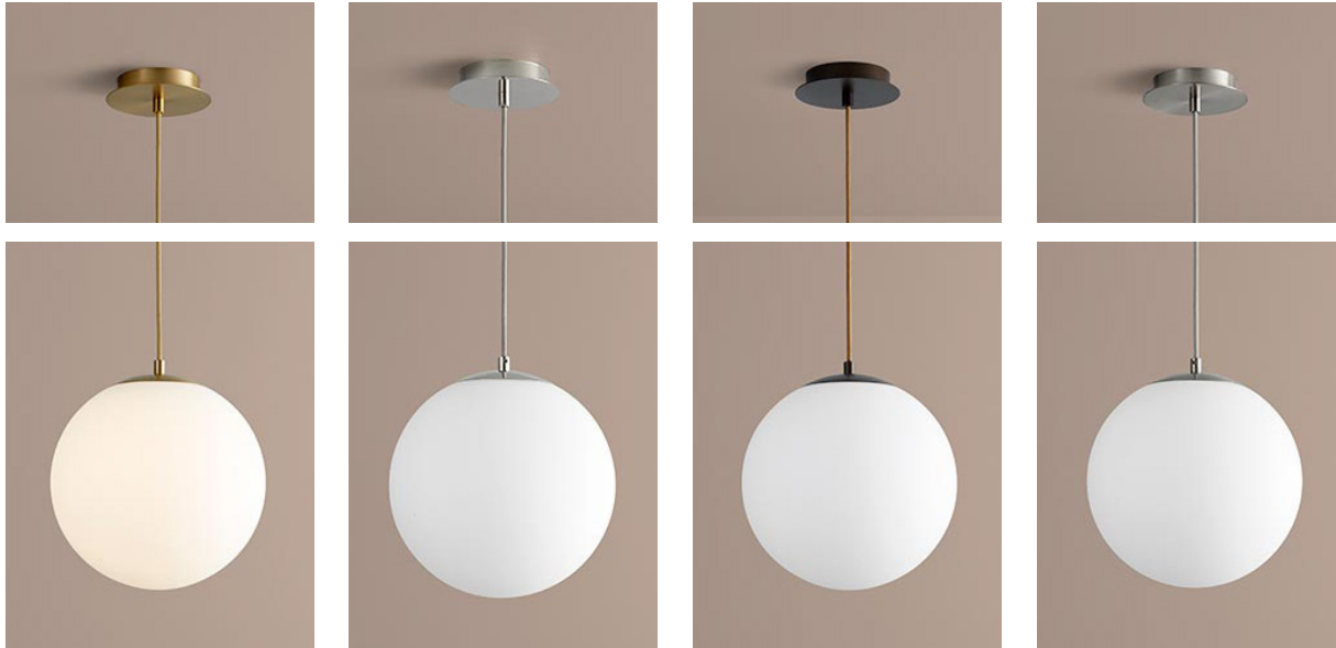
-40 Aged Brass -20 Polished Nickel -22 Oiled Bronze -24 Satin Nickel

FIXTURE TYPE _____ LOCATION _____ PROJECT _____ DATE _____