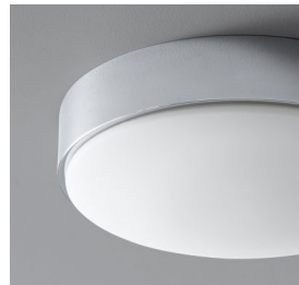
-14 Polished Chrome