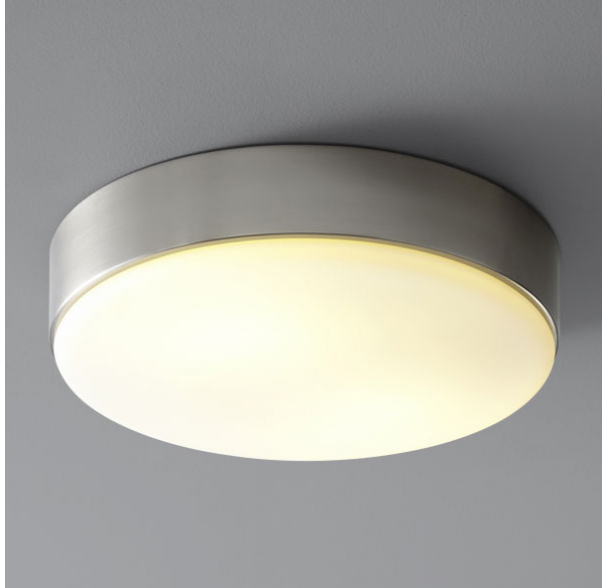
-24 Satin Nickel