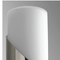
-1 White Opal Glass