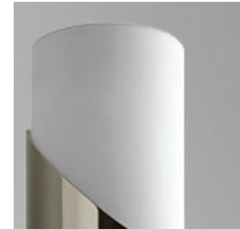
-2 Matte White Acrylic