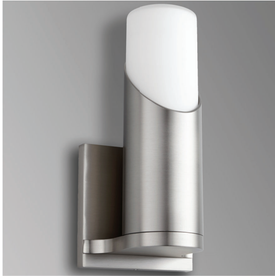
-24 Satin Nickel