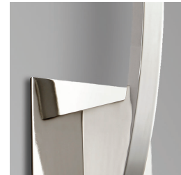
-20 Polished Nickel

LIGHT SOURCE 1 x 12.0W LED, 3000K, CRI 90