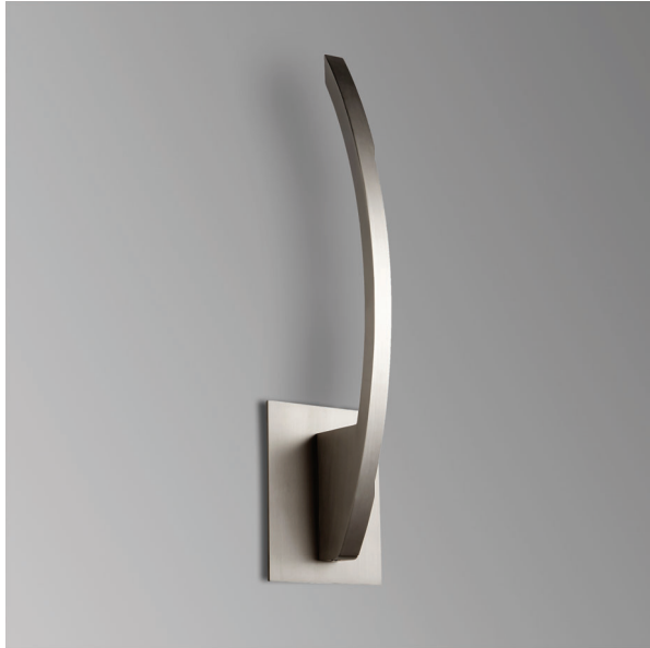
-24 Satin Nickel