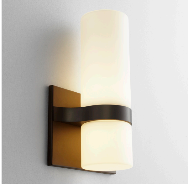
-22 Oiled Bronze