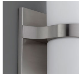
-24 Satin Nickel