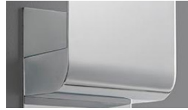
-14 Polished Chrome