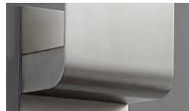
-24 Satin Nickel