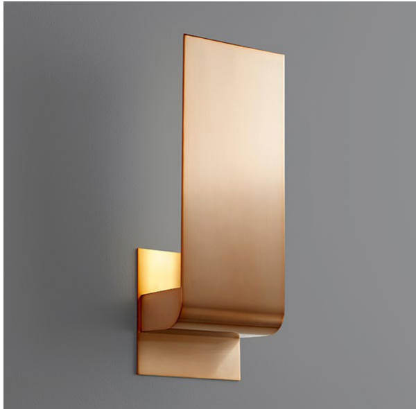
-25 Satin Copper