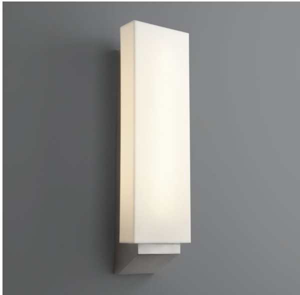
-24 Satin Nickel