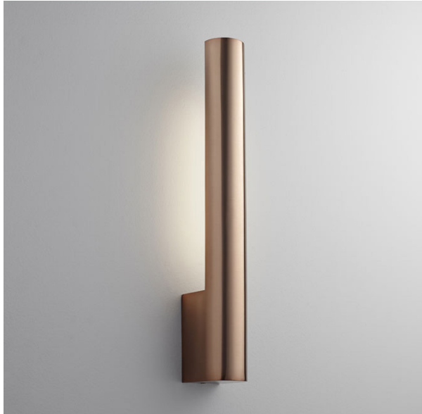
-25 Satin Copper