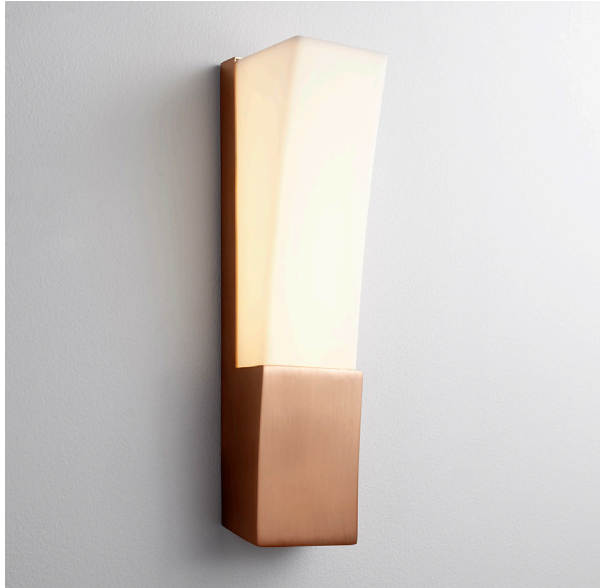
-25 Satin Copper