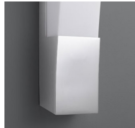
-14 Polished Chrome