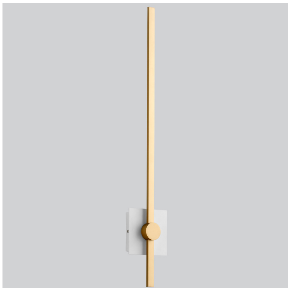
-650 White/Industrial Brass