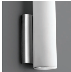
-20 Polished Nickel