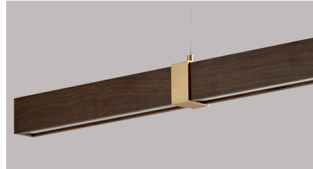
-2440 Walnut/Aged Brass (with Aged Brass Canopy)