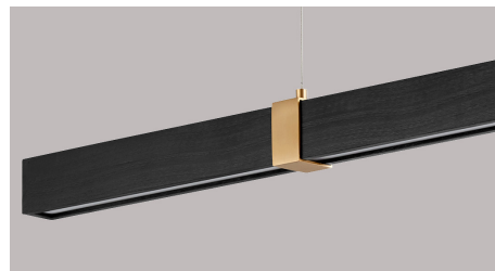
-1540 Black Oak/Aged Brass (with Aged Brass Canopy)