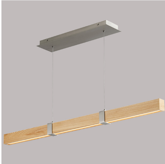
-5224 White Oak/Satin Nickel