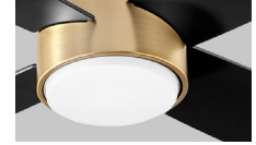
With optional light kit

SPECIFICATIONS 4 ABS Blades / 52" Blade Sweep / 14° Blade-Pitch 153x18 Motor 3 Speeds - Reversible 0.54A on high / 0.28A on low 64W on high / 16W on low 153 rpm on high / 74 rpm on low Wall control (Included) Remote Control 3-8-1000-0 (Optional - Not Included)