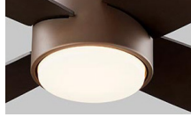
With optional light kit