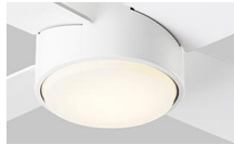
With optional light kit