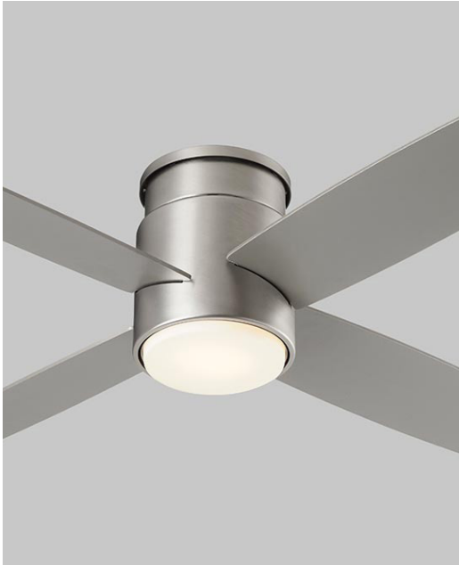
-24 Satin Nickel with Optional Light Kit