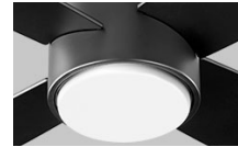
With optional light kit