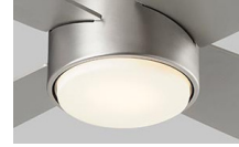
With optional light kit