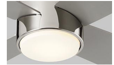
With optional light kit